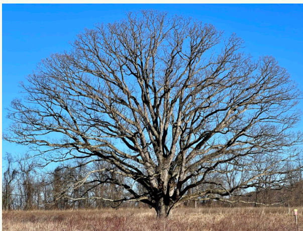
Photo of big oak tree at Bryn Coed Preserve

It isn't just trees in winter. New beginnings often come this way, in the quiet of in-between times, when everything is still, or even bitter and cold. We may be going through a winter of the spirit, when hope seems impossibly