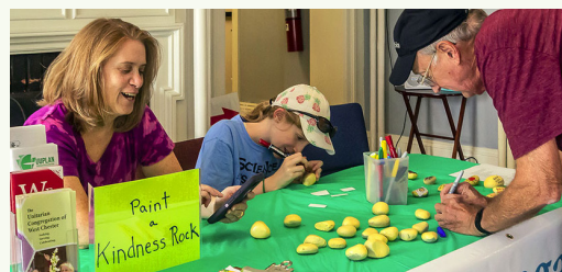
Making Kindness Rocks in 2019

All ages of children, youth, and adults are invited to join us on Sunday, April 18, at 1 pm for a Zoom Painting Party, as we make Kindness Rocks together. Kindness Rocks are simply rocks we use to paint images and phrases on to spread kindness and happiness to others, and they are placed where others can easily pick them up and take home some kindness.